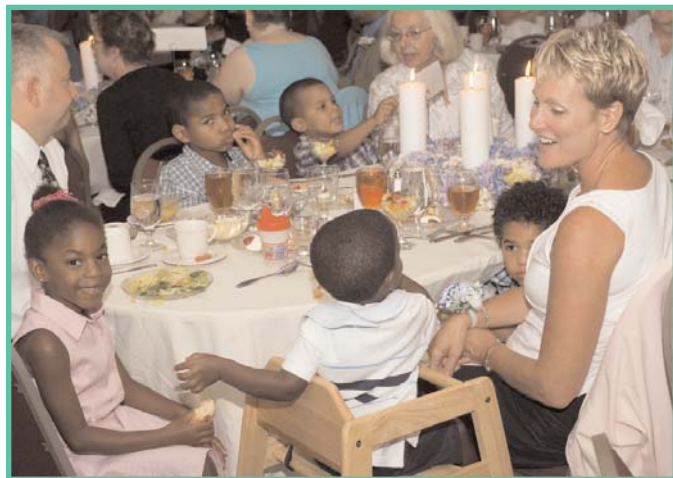
Shorter family enjoys their meal at the Permanency Conference Recognition Banquet.